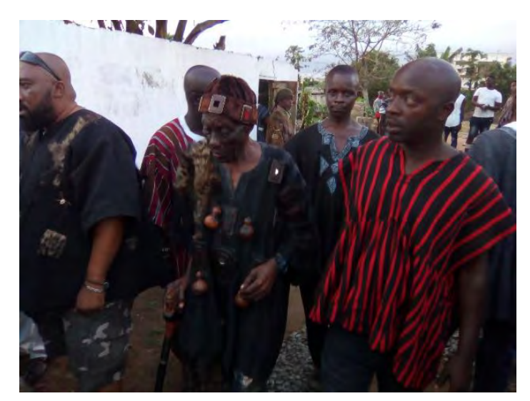
Figure 23. Adumhene at nsorem.