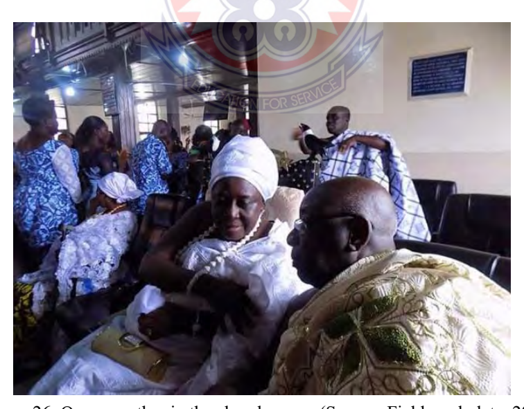
Figure 26. Queen mother in the church room.