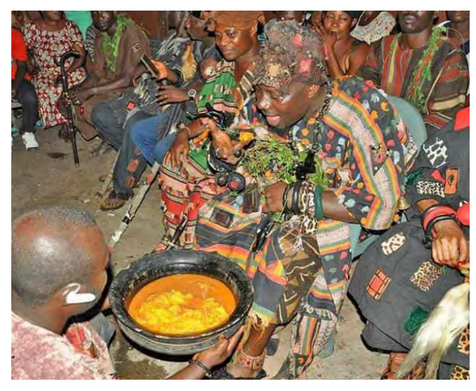
Figure 11 Banmuhene eating nnoma at krubiihene residence.