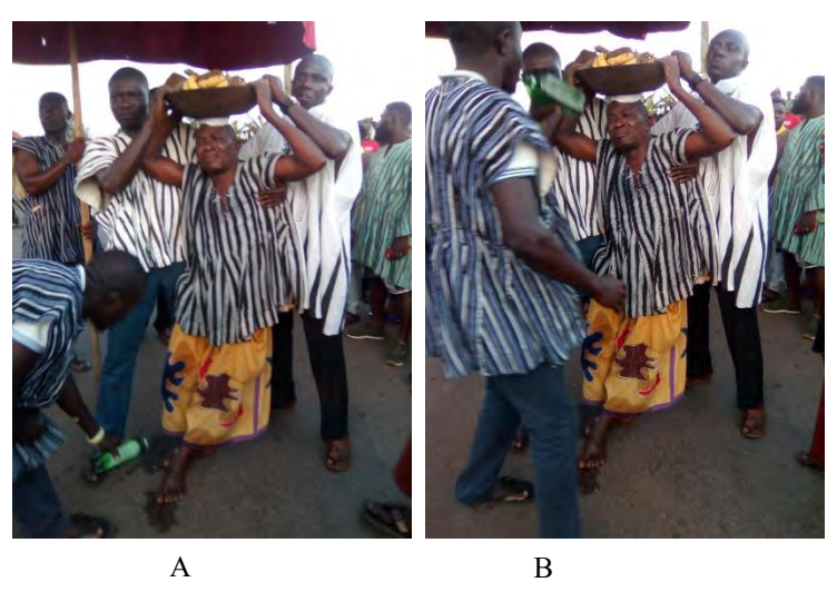
Figure 22. Schnapps poured on the feet of a possessed maiden to move. 90