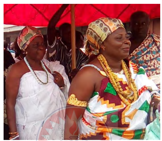
Figure 47. Queen mothers wearing beads to church service on Sunday