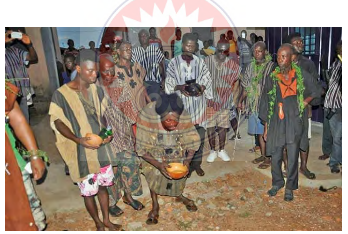
Figure 9 Schnapps and palmwine for making libation after Returning from Amanprobi.