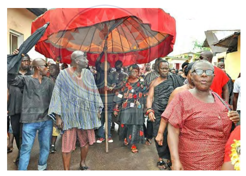
Figure 18. Queenmother, going round greeting and offering condolences to all occupants of stools in the town.