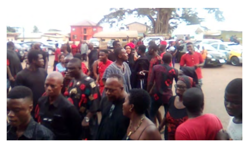
Figure 17. Gathering in front of the palace.