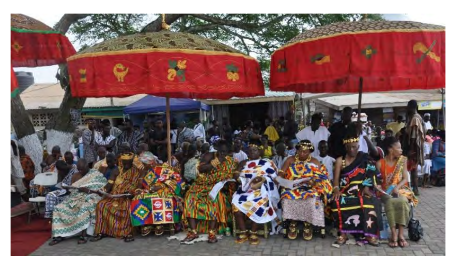
Figure 42. Queen mothers and Sub chiefs sitting in state