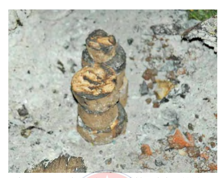
Figure 4. Roasted yam.