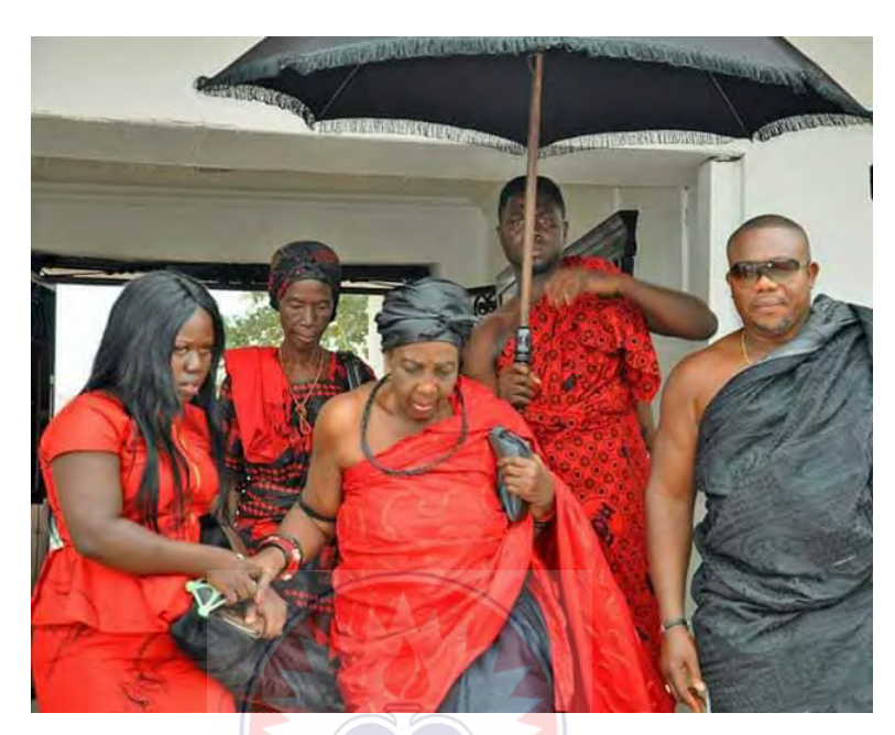
Figure 13. People in mourning costume.