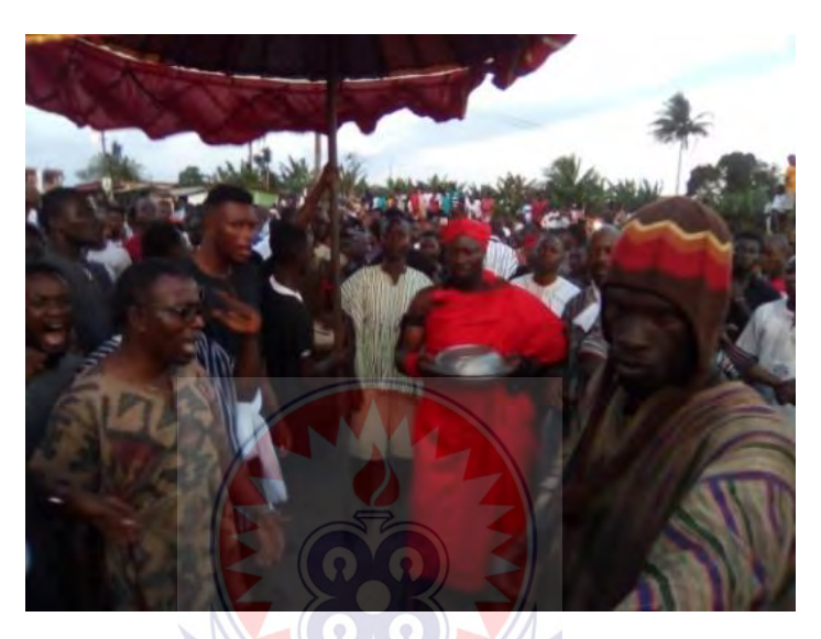
Figure 73. A bowl of food for ancestors.