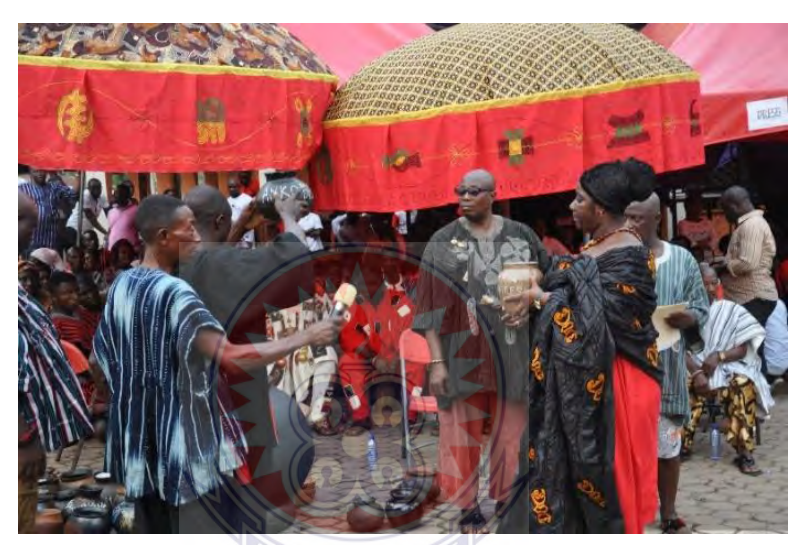
Figure 31. A clan presenting their drink to Asafohene.