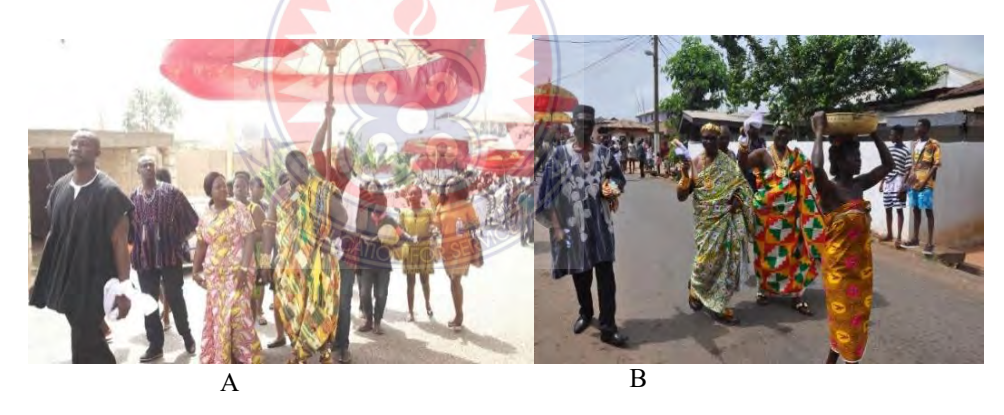
Figure 49. People of Mamfe dressed in their clothes as they walk through the principal street at Mamfe