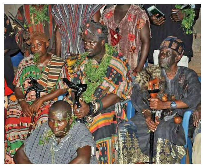
Figure 48. Banmuhene dressed in his traditional military attire clad with leaves.

various groups and individuals also put on special costumes for the celebrations. These textiles products add beauty to the ceremonies (figures 48, 49 A, B).