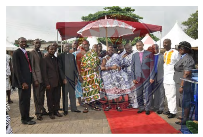
Figure 45. Mamfehene and clergy after the thanksgiving service