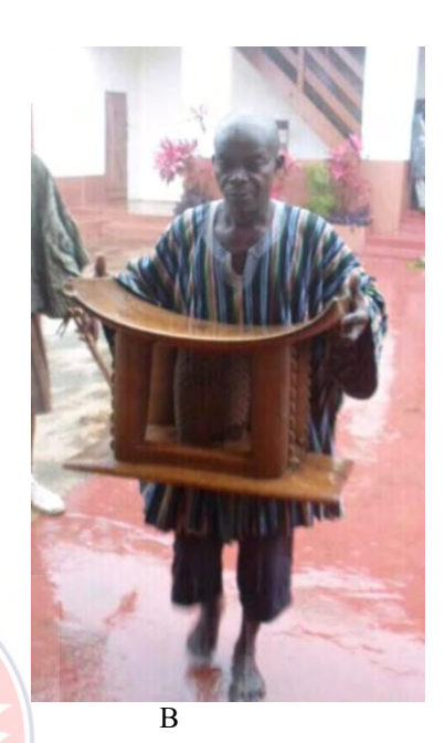
Figure 7. Taking the cleansed white stools to the inner court of the palace.