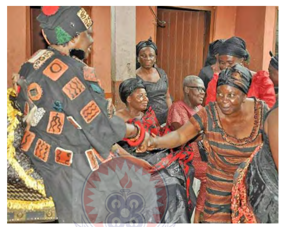
Figure 15. Queenmother, sit in state to receive guests and well-wishers.