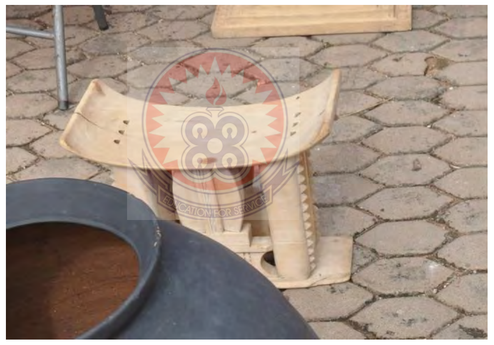
Figure 61. Stools placed behind the pot during the festival.