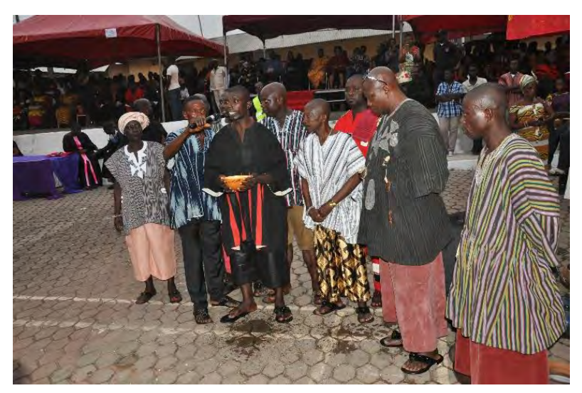
Figure 35. Asafohene making libation for the drinking to start.