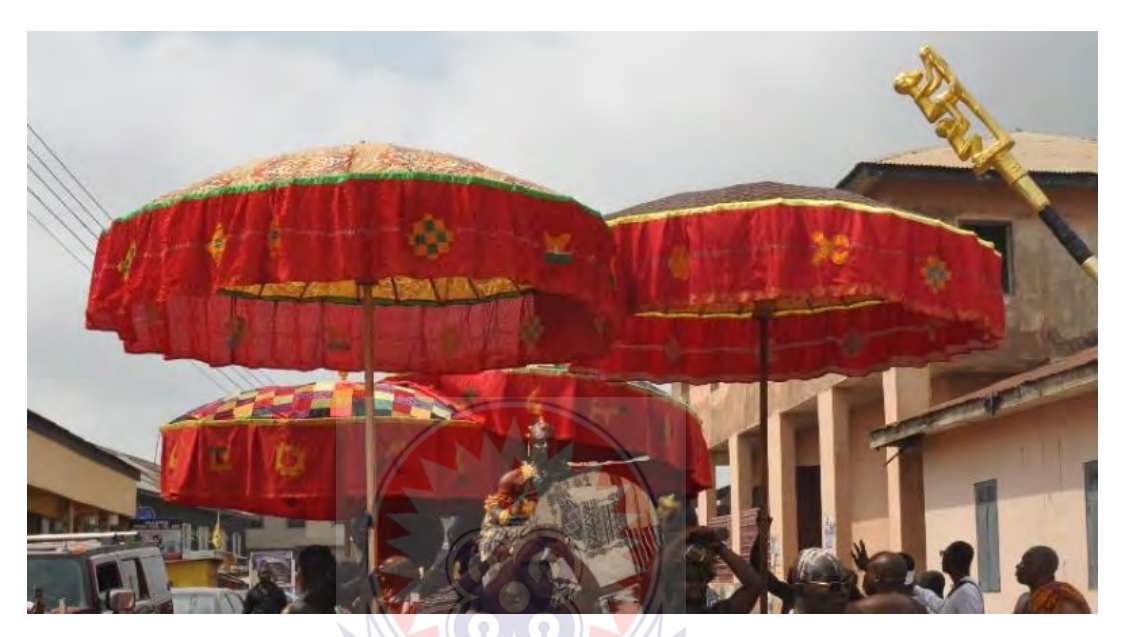
Figure 50. Mamfehene covered with umbrellas and goes through the principal street at Mamfe

to the ancestral shrines by the people of Akropong during the Odwira festival, the maidens who carry the food to the ancestral home are covered with an umbrella. (figures 50, 51, 52). This art product used protect the people and enhance the beauty of the occasion.