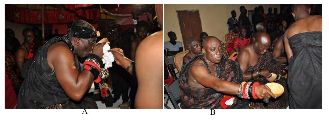
Figure 36. Mamfehene and his sub chiefs drinking from the pot.