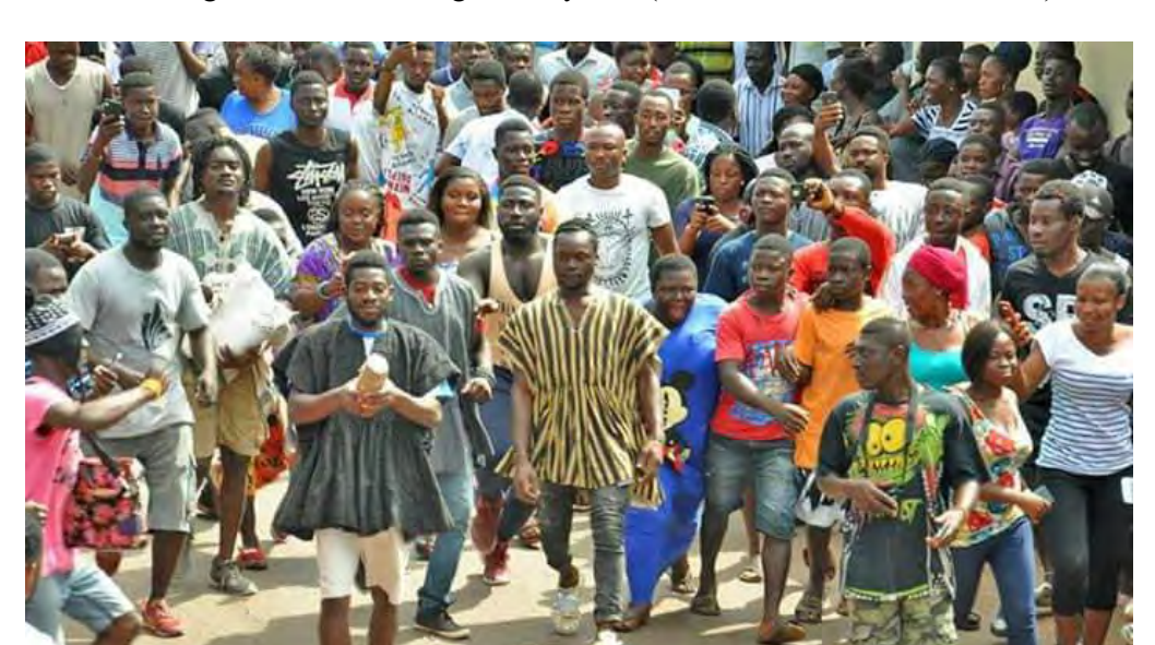
Figure 1. Krubiihene give out yams.