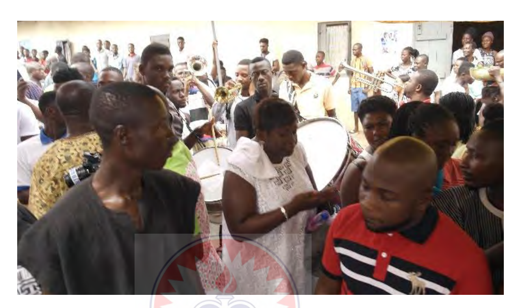
Figure 37. The brass band displaying.

booming of drums, mooing of horns, whistle of flutes, clang of gong-gones, chants of minstrel, recitation of panegyrics, traditional history, ensembles for dances and cultural display.