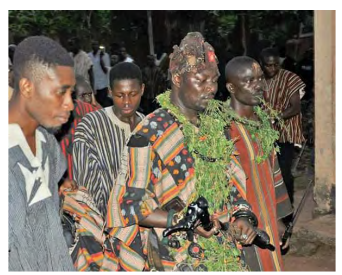
Figure 8 Return from amanprobi with the Odwira symbol