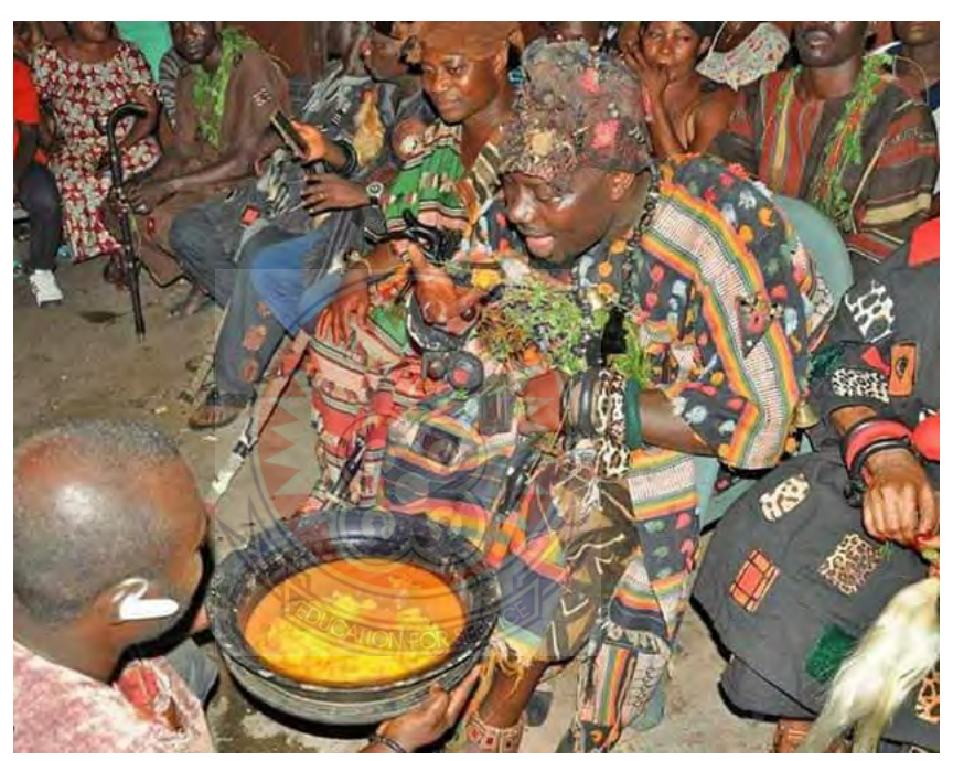
Figure 77. Banmuhene eating from Earthenware bowl