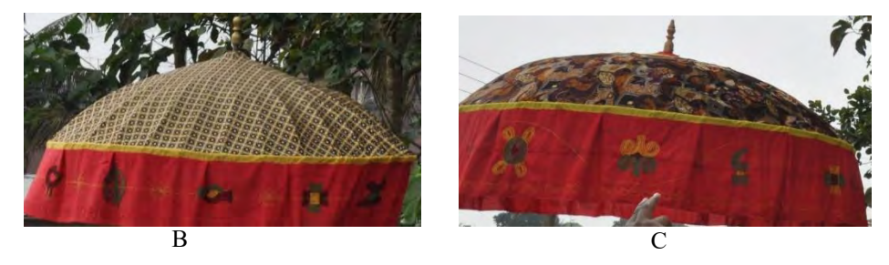
Figure 68. Umbrella tops at the durbar grounds.