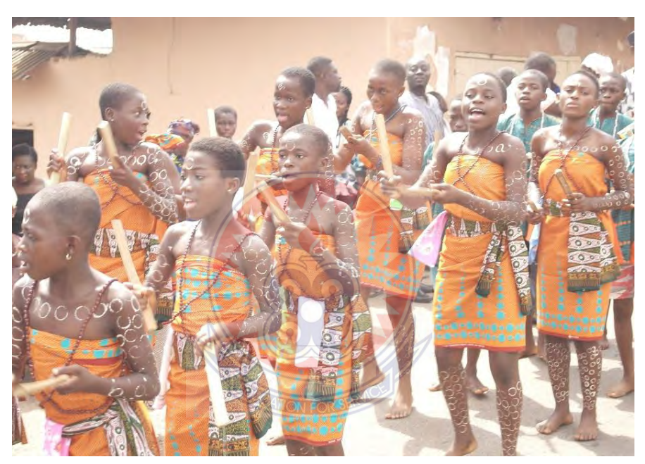
Figure 54. A youth group have body painted white as they performed during the Ohum at Mamfe