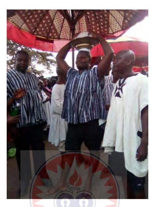
Figure 52. A maiden covered with umbrella in a procession to nsorem.