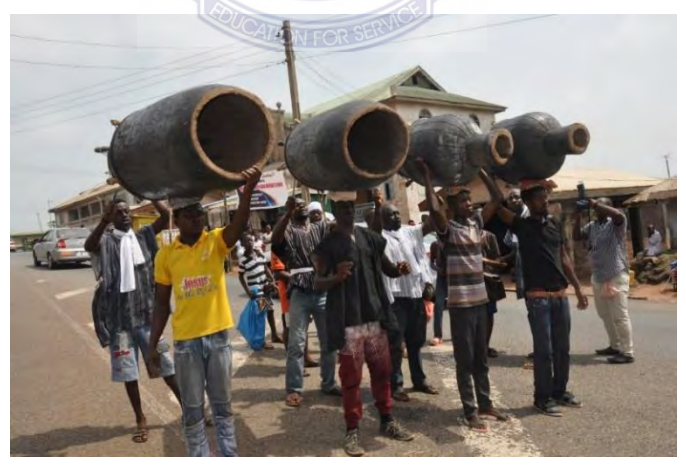
Figure 66. Fontomfrom and Atumpan being played.

The drum is a musical instrument consisting of a skin or hide stretched across a hollow frame and played by striking the stretched skin. The drums are used by the royal house to communicate and for a tune for the chief as a talking drum (Atumpan). The drums for the royal families have some relief carvings of adinkra symbols on them. Example is the fontomfrom. These drums are used to enhance the performance the festivals. Every chief is followed by set of drummer drumming (figures 66, 67). During the lifting of Ban on Noise Making the big fontomfrom drums as well as the other drums were beaten and people danced to signify the end of the ritual preparation period.