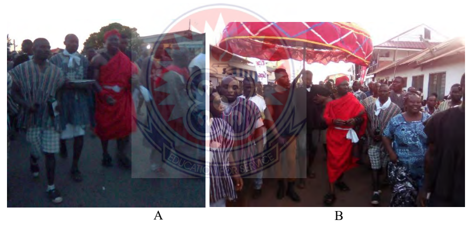
Figure 24 Banmuhene sprinkling food and drinks to nananom.