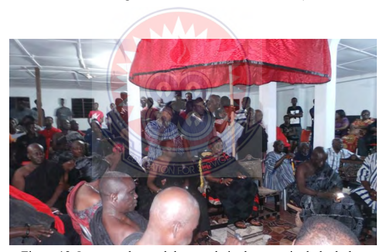
Figure 12 Queenmother and the people in the court in dark cloths