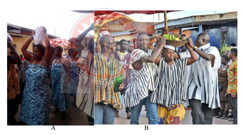
Figure 21. Possessed maidens in a procession to nsorem.