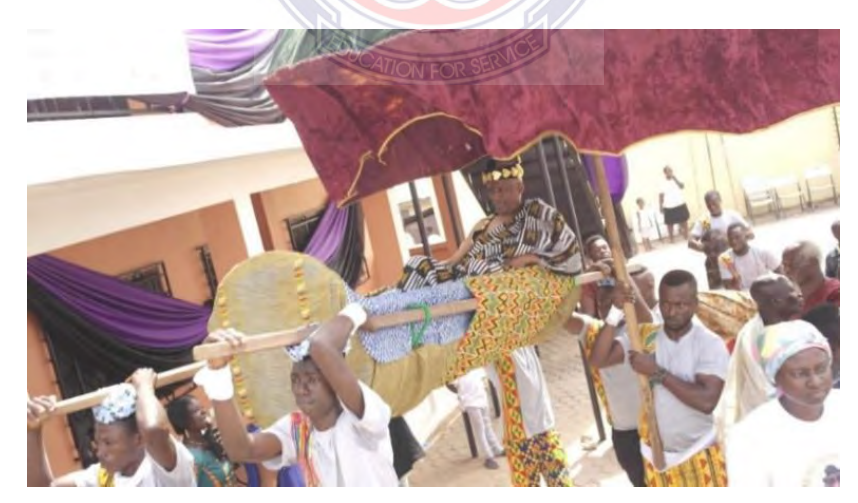
Figure 58. Chief carried in a palanquin.

During the procession in the midafternoon on Friday and Saturday many of the chiefs are carried in palanquins and paraded through the principal streets of Akropong and Mamfe on the last day of the festivals, ending in a grand durbar (figures 58, 59). The Chief dances in the palanquin signifying his authority and supremacy over the state and the indigenes.