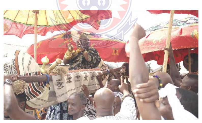
Figure 64. Mamfehene dancing with the sword.

Sword is a handled weapon with a long blade that is sharp on one or both edges and sometimes carved handle. It serves as a weapon (fighting sword) and also symbolizes the state authority. It is made up of the handle and a blade with motifs and symbols incised in them. During the Akuapem festivals most the chiefs dance with the sword (figures 64,65). Showing a sign of authority and supremacy over the indigenes.