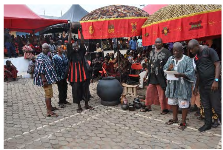
Figure 32. Asafohene announcing the names of the donors.