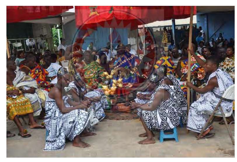
Figure 40. Sword bearers at the durbar ground.