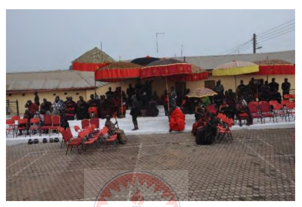
Figure 28. A gathering at the durbar grounds for the ceremony.

the Asafokyeame with intermittent cultural displays, recitations and dancing at its best (figure 36).