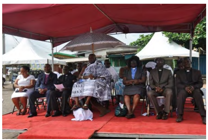
Figure 44. The clergy and some dignitaries at the thanksgiving service.