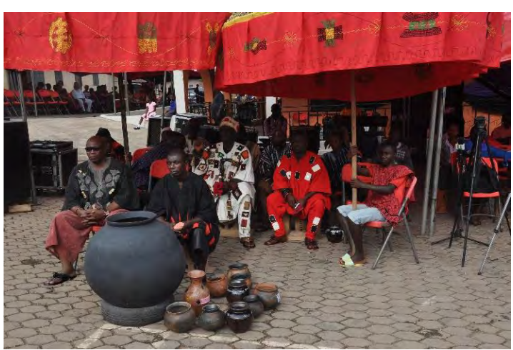
Figure 29. Asafohene sits behind the big pot to receive the drinks.