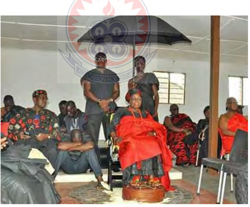
Figure 57. Okuapemehenmaa sits in public with her feet on the pouffe. 4.22.6 Sculptuss urce: Field work data, 2017)

A large thick cushion used as footstool or as a seat with no back. Footstool pouf is the perfect item to use as a footrest. Decorative piece pouffe can be used as extra seating space. It can be used as a hassock. During Akuapem Odwira festival, the Akuapem Okuapemehenmaa (queen mother) sits in public with her feet on the pouffe. At times when queen mother is addressing her subjects or receiving visitors her feet is seen on a pouffe. (figure 57).