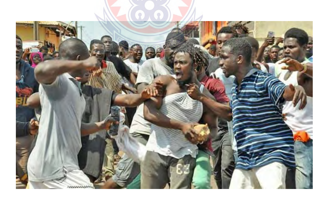
Figure 3. Youth groups struggle to break the new yam.