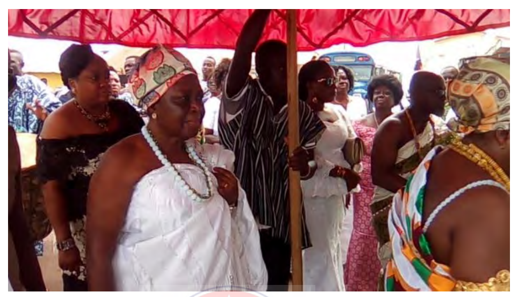
Figure 25. Queen mother on her way to church.

Okuapeman to God for His care and providence in the year. At the end of the service, there was a procession of the chiefs through the principal street of the town to the palace. (figures 25, 24, 26)