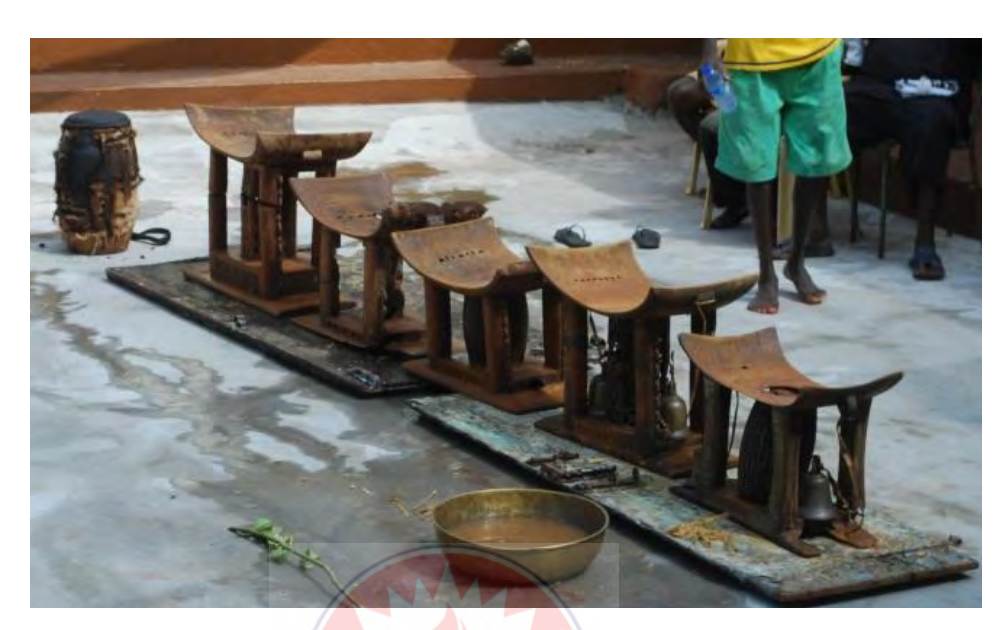
Figure 5. White stools arranged to be cleansed.