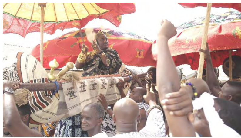
Figure 39. The Mamfehene rides in a palanquin dancing.