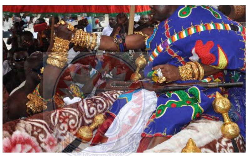
Figure 70. Two sub chiefs displaying their rings.