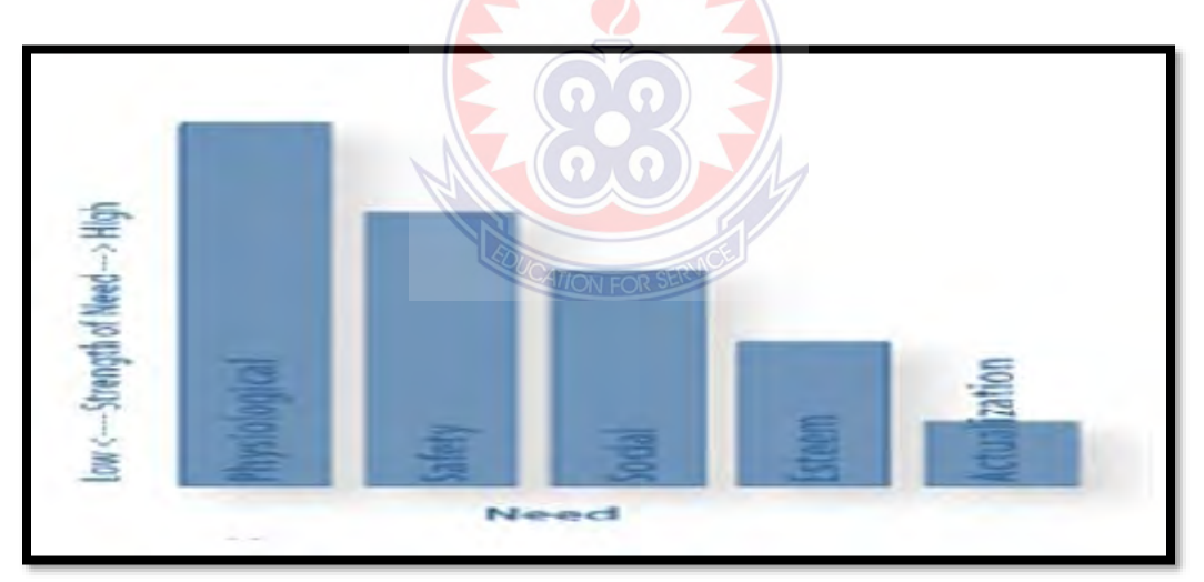
Figure 2.1: Maslow's Hierarchy of Needs Source: (Mullin, 2002).

Maslow's Hierarchy of Needs theory postulates that humans have specific needs that must be met. His view about motivation is that people are ''wanting beings''. Thus, they always want more and what they want depends on what they already have (Mullin, 2002). He postulated that human needs are arranged in a hierarchy of importance in five steps.