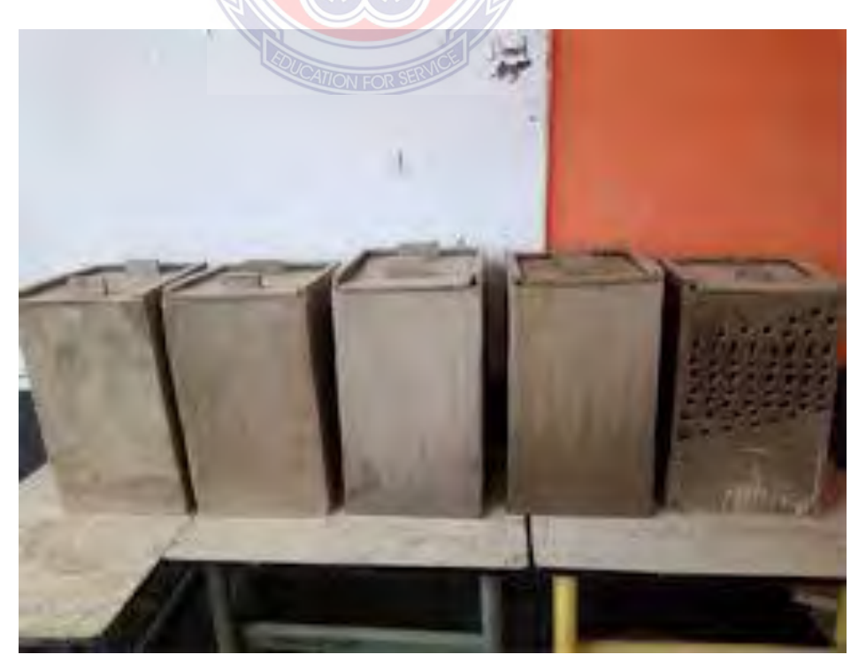
Figure 3 - clay containers for curbing plantain post-harvest losses designed by Mercy Abakah Atta