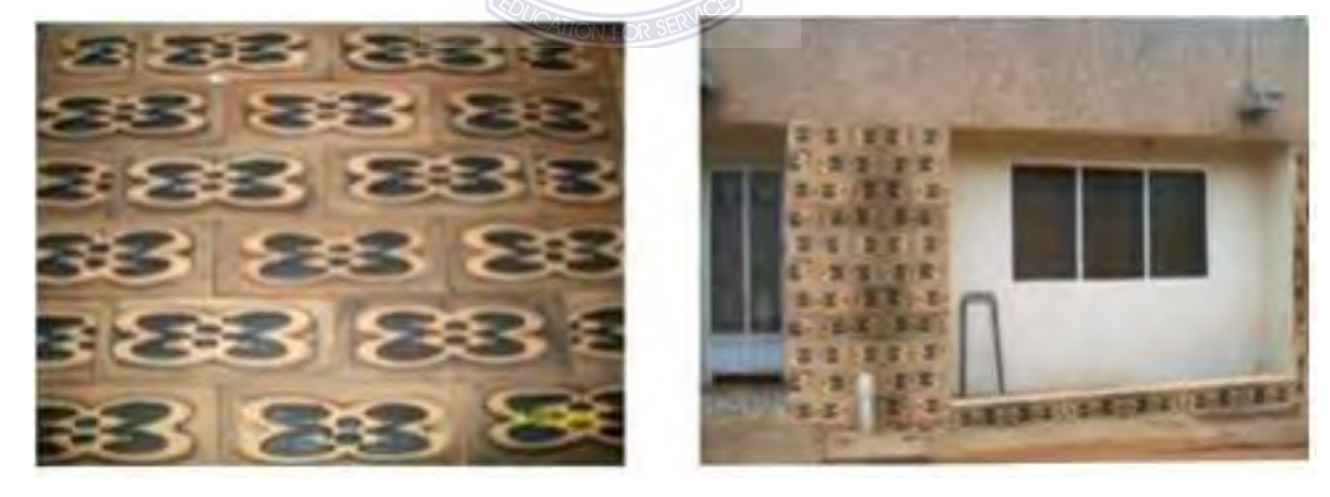
Figure 5 - Embossed Kroy \varepsilon Slices on a Building designed by Henrietta Barfi Mensah & co