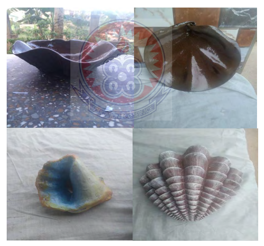
Figure 8 - Feminism as a Model in Pottery artworks of Mercy Abaka-Attah