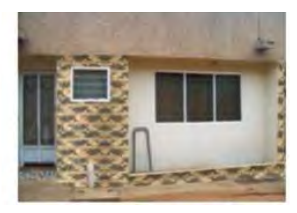
Figure 7 - Embossed Anieden Slices on a Building designed by Henrietta Barfi Mensah & Co