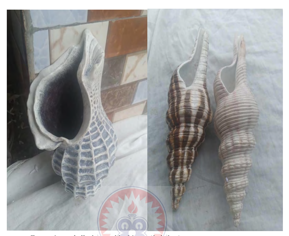
Figure 6 -seashells designed by Mercy Abakah- Atta