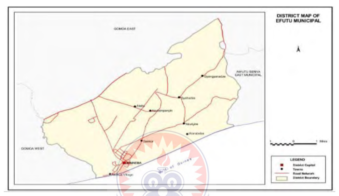
Figure 2: Map of the study area

number of basic schools in the East, West, and Central circuits is 39, 33 and 23, respectively. The junior high schools in the rural communities in the Municipality includes Ateitu/Osubonpanyin M/A, J.H.S, Gyangyanadze M/A, J.H.S, Atekyedo M/A, J.H.S, Gyahadze M/A, J.H.S and Essuekyir M/A, J.H.S (Effutu Municipal Education Directorate, 2017).