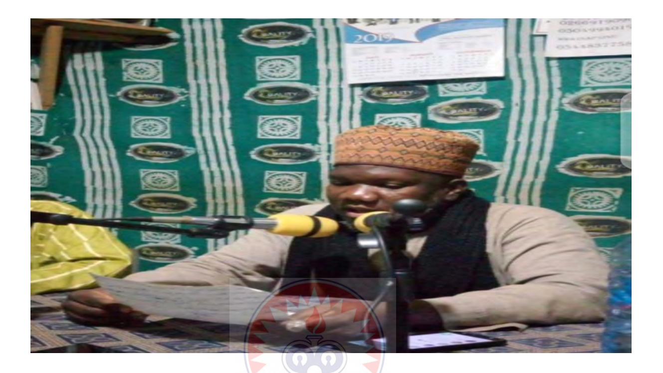
Figure 2: An Islamic cleric in the studios of Quality FM delivering sermon.

appeared on different segments to preach, teach and direct their followers on their best practices and accepted ways of life in their subscribed faith. This program provides a platform to religious bodies to preach morality and speak against immorality.