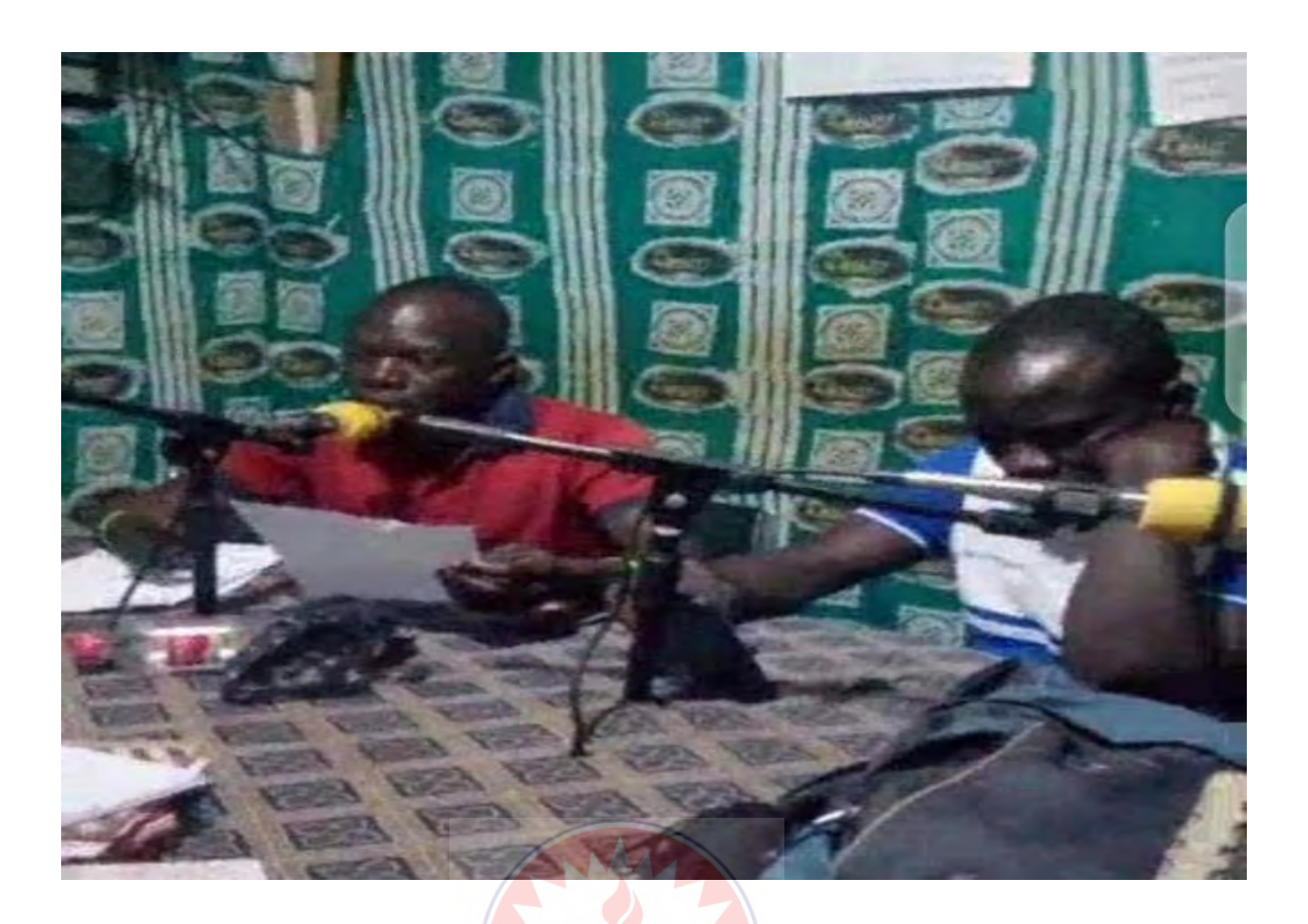
Figure 3: Agric extension officers discoursing best farm practices during the time with farmers in the studios of Quality FM

The program has a phone-in segment that allows farmers to contribute to the program. During the phone-in segment, the farmers are given the chance to share their own success stories and also ask questions for answers from the experts in the studio.