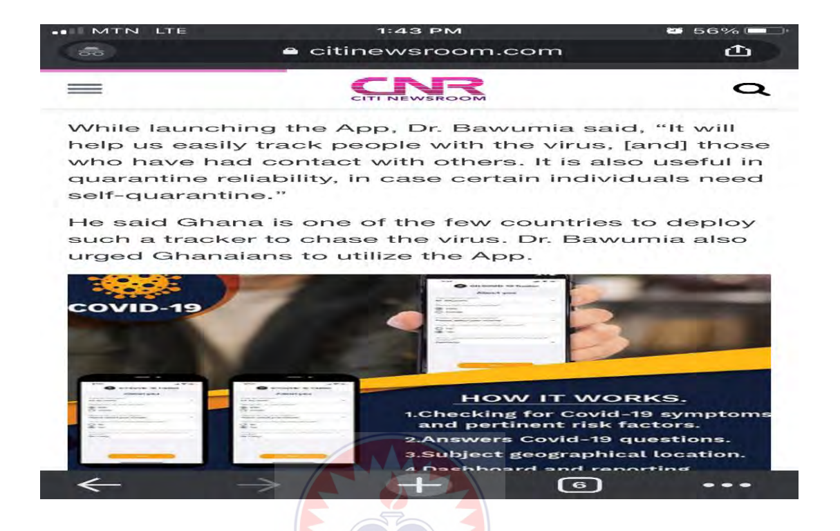
Figure 1: A Screenshot of Citinewsroom.com Reportage on COVID-19 Stories that Employed Two Multimedia Content; text and image .

The image in figure 1 shows the enhancement given to the news story or the image attached to the text to attract the attention of audiences. The image talks about the Ghana COVID-19 Tracker App with directions on how to use the App. The application addresses all COVID-19 questions. As the name suggests, it is used to track all who have or show signs and symptoms of the virus and their location.