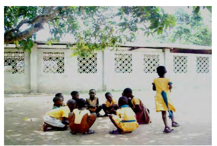
Figure 4 : Children Playing Musical Games Outside the Classroom