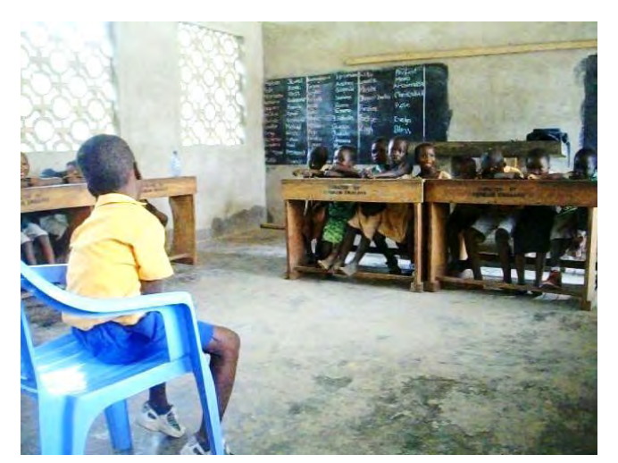
Figure 9: Children Narrating Stores to their Colleagues