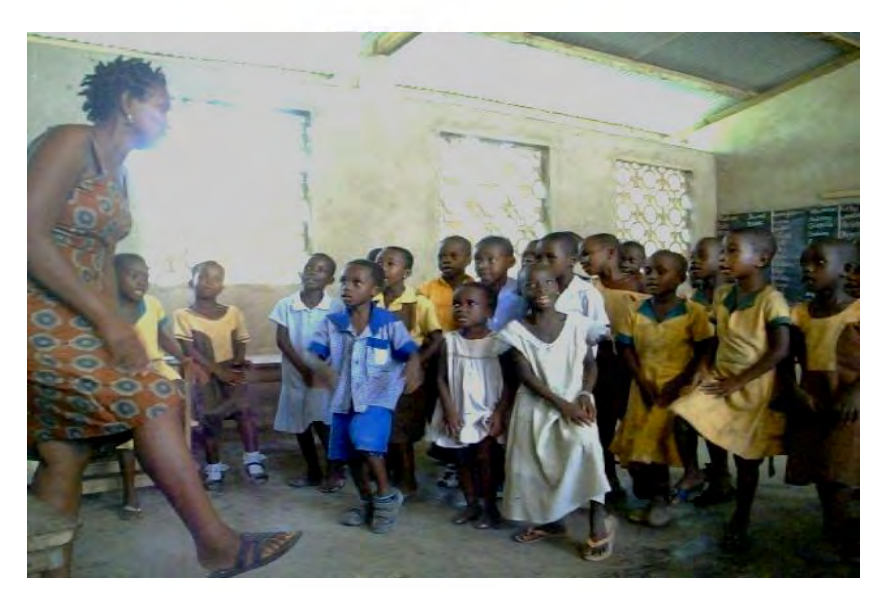
Figure 1: Teachers and Children Performing Abiba Picture by: Mawuse Adiakpor.

Upon the usage of folk songs of other languages, it was revealed that, children do not sing those folk songs very well. They find it very difficult to pronounce some of the words clearly, just because they are foreign to them for example, " Mamma chale wote ba, Dada be t4 bi mame " and "In our dear LORD's garden". The researcher observed children in singing these songs. The researcher's observation on singing "Mama chale wote ba" was that children could not sing the song from the beginning. It was the teacher that led in singing the song, and when she reached "Abiba nae kakaraka, Ashietu nae kitinkiti" that the children joined in singing that part with the gestures. Behind is a picture showing how children performed one of the songs.