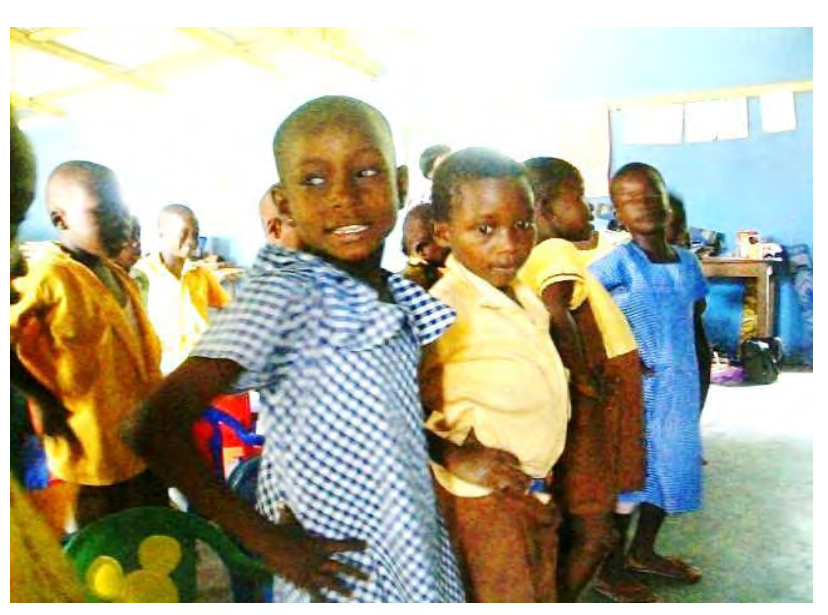
Figure 3: Children Reciting Poems and Rhymes