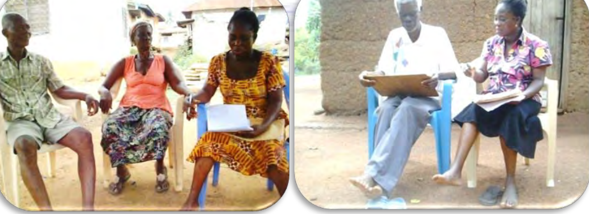
Figure 11: Researcher Interviewing Parents