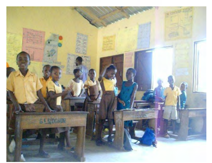
Figure 10: Children Performing a Folk Song after Storytelling Lesson