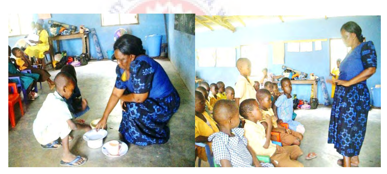
Figure 6: Teacher Doing a Demonstration and Discussion after Performing a Folk Song

This rightly supports what Nketia (1999, p. 2) explains that, "what the teacher provides will not only make for any manifest deficiency in the upbringing of children but also strengthen the consciousness of identity". The children also learnt about the food habit of the people of Ve.