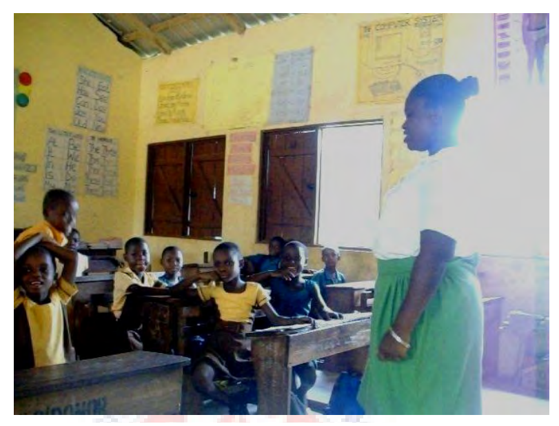
Figure 7: Teacher Discussing the Historical Song with Children

drawn from traditional and contemporary repertoires. The selection of these songs should include songs from various ethnic groups. (Nketia, 1999, p.32)