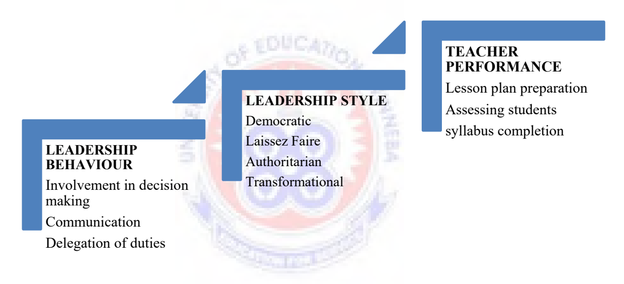
Figure 2.2: Conceptual Framework

Based on the literature review, a conceptual framework on the impact of leadership styles on teachers' performance is attempted here. Consequent to the review of House's (1968) path-goal theory (Section 2.2.1) a conceptual framework relating the variables in the study as indicated in Figure 2.3.1.