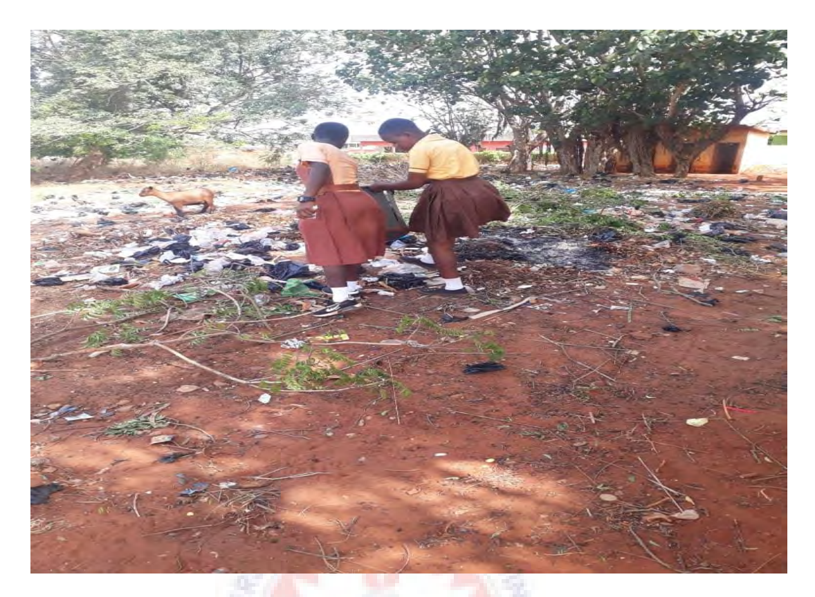
Plate 4.4: A typical refuse dump at Prampram D/A Basic School

Based on sampled pictures that were gathered at some schools in Ningo-Prampram District, it was indicative that most of the public basic schools had challenges with source of water for cleaning, poor state of toilets and urinals and not properly sited waste disposal places. In other schools, it was either pupils were made to use makeshift structures for urinals and toilets or they were entirely not present. It was also observed in some instances that pupils had to trek to almost distant places to fetch water for use at school. Because these locations were somehow far from the school, pupils sometimes missed instructional periods which are not good for effective academic work.