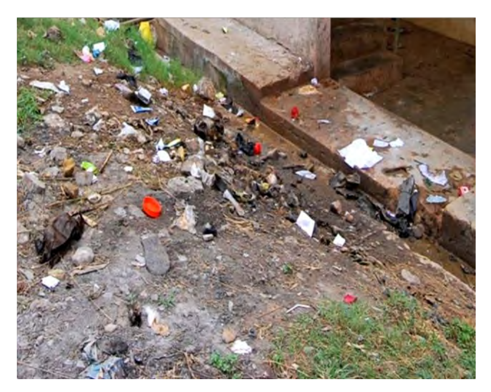
Plate 4.5: Clogged drain system that breeds insects in Salvation A and B Basic Schools

which are only diagnosed in major hospitals and laboratories. Hence, it is indicative from the results gathered that inefficient WASH conditions in school had negative health implications on pupils or even persons who used certain places and facilities in the school. In many countries there exist a high prevalence of water and sanitation related diseases, causing many people, children in particular, to fall ill or even die. Improved hygiene practices are essential if transmission routes of water and sanitation related diseases are to be cut.