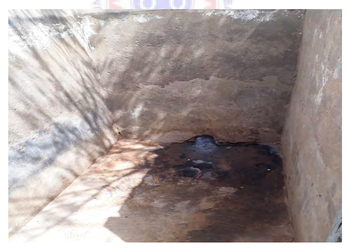
Plate 4.1: Urinal used in St Joseph Anglican Basic School

In some pictures that were captured in some schools in the Ningo-Prampram District, it was indicative that most of the schools in the district were encountering varying challenges with their sanitation and hygiene situation. The pictures are displayed in plates below.