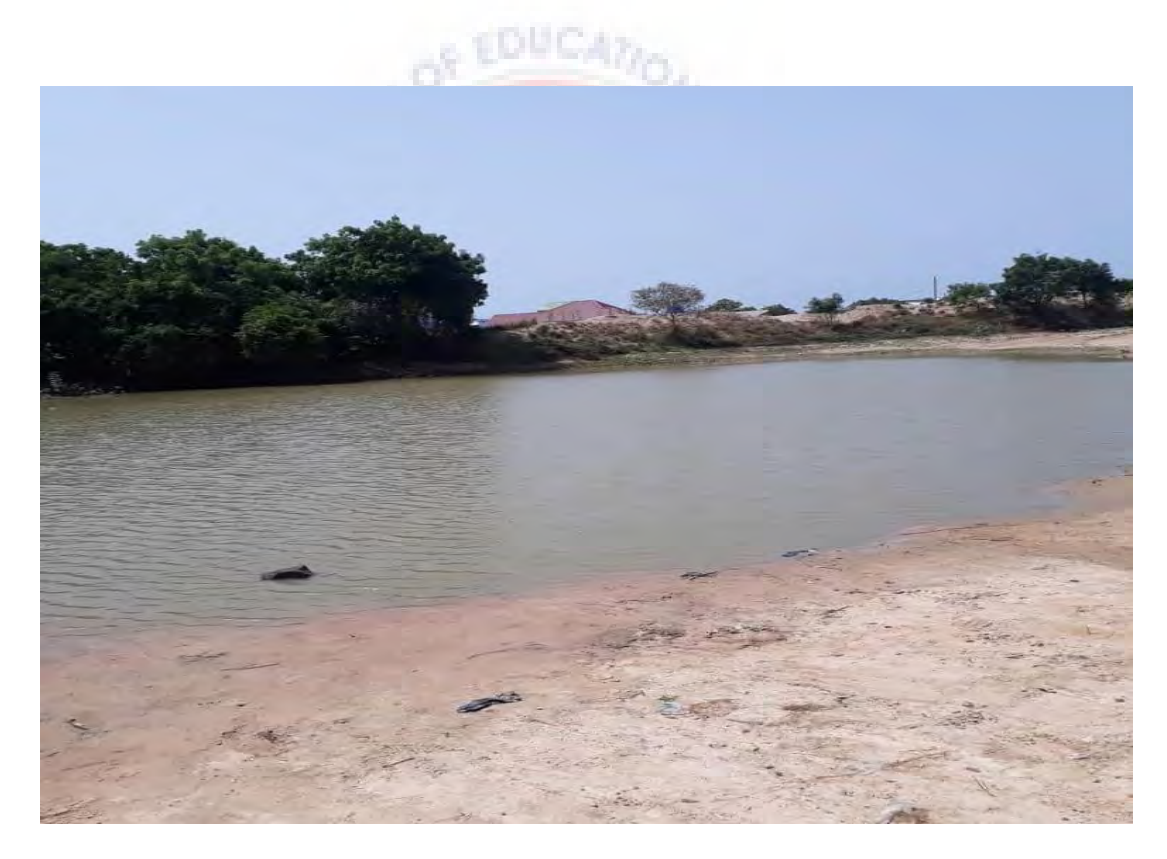
Plate 4.3: Source of water (semi dam) used for multiple purposes in Abia D/A Basic School