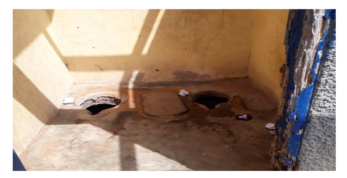
Plate 4.2: A typical toilet facility used in Methodist D/A Basic School